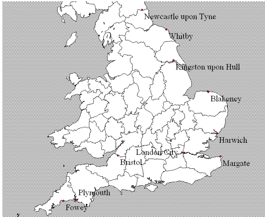
Map 1: Home ports in England